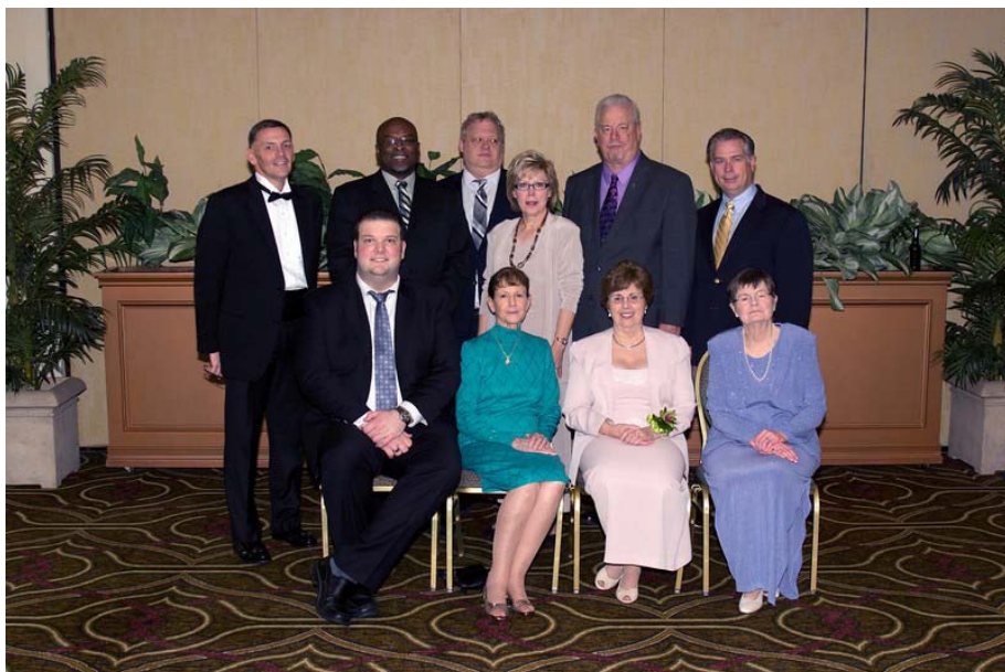
National Association of Parliamentarians Board of Directors, 2013-2015