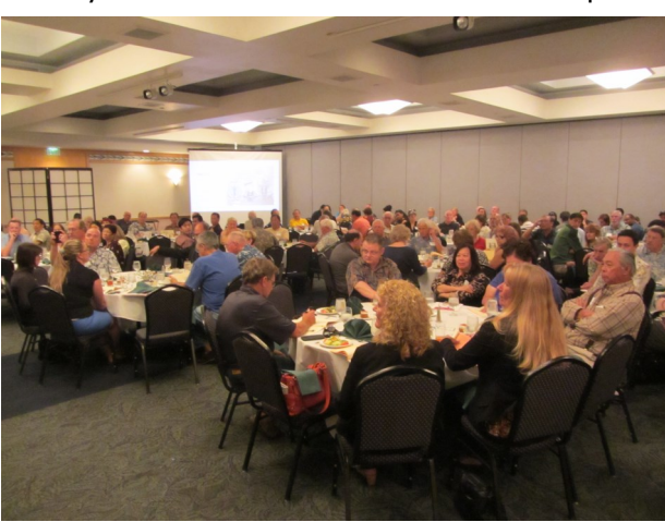
Parliamentary workshop in Honolulu

NAP has education for anyone wanting to know more about meeting management and leadership training. Have you been on the NAP website lately? If not, check out the new materials and opportunities for leadership enhancement. Encourage your friends to attend an area workshop