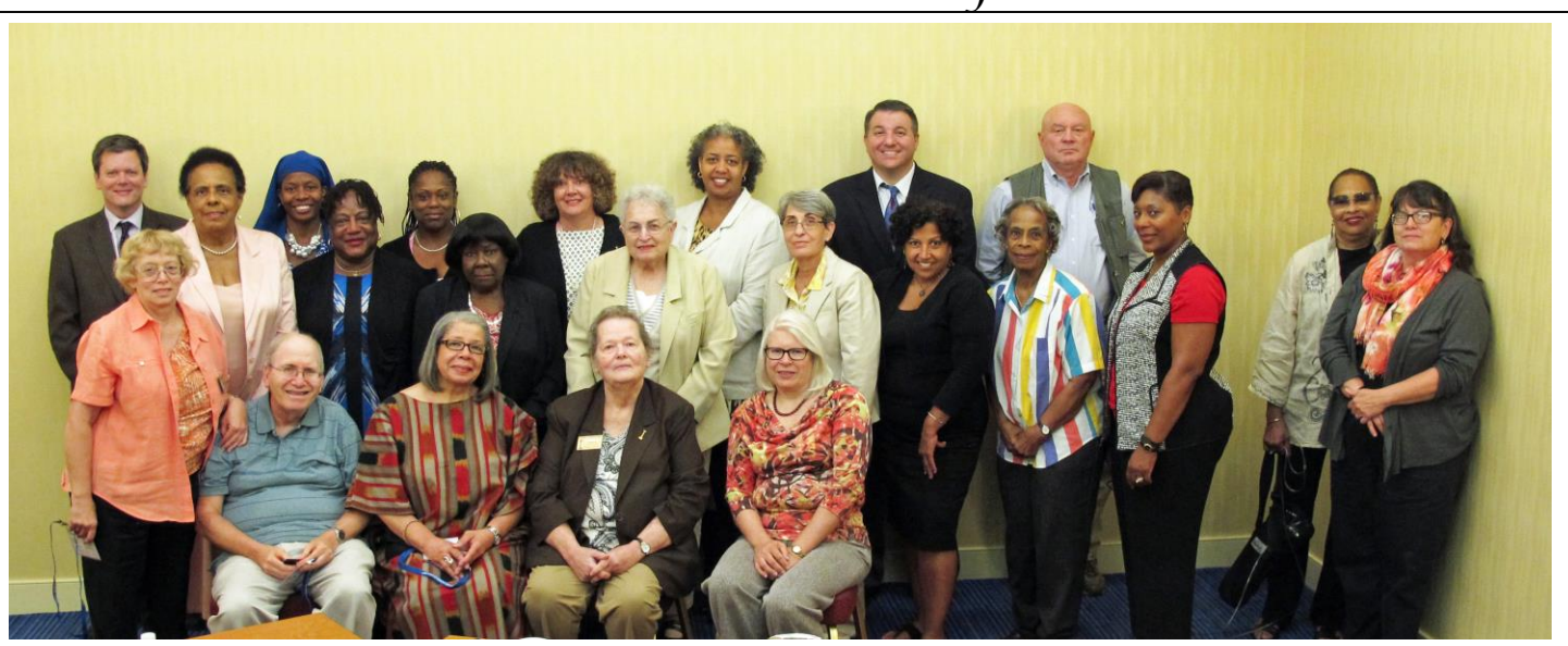
District One Meeting at the NAP Convention in Arlington, VA, September 4-7, 2015