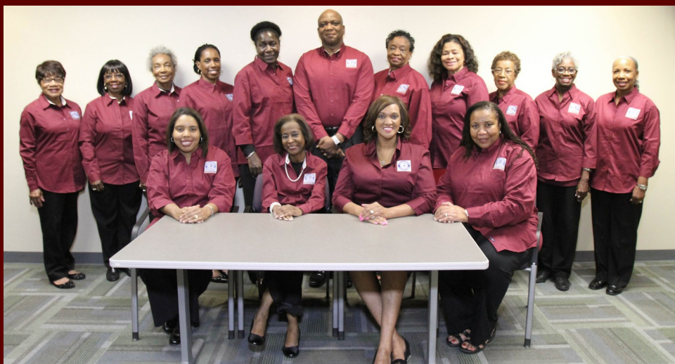
The Sounding Block Unit - Dallas, Texas

Contact Samuel Bates mtate@sbcglobal.net