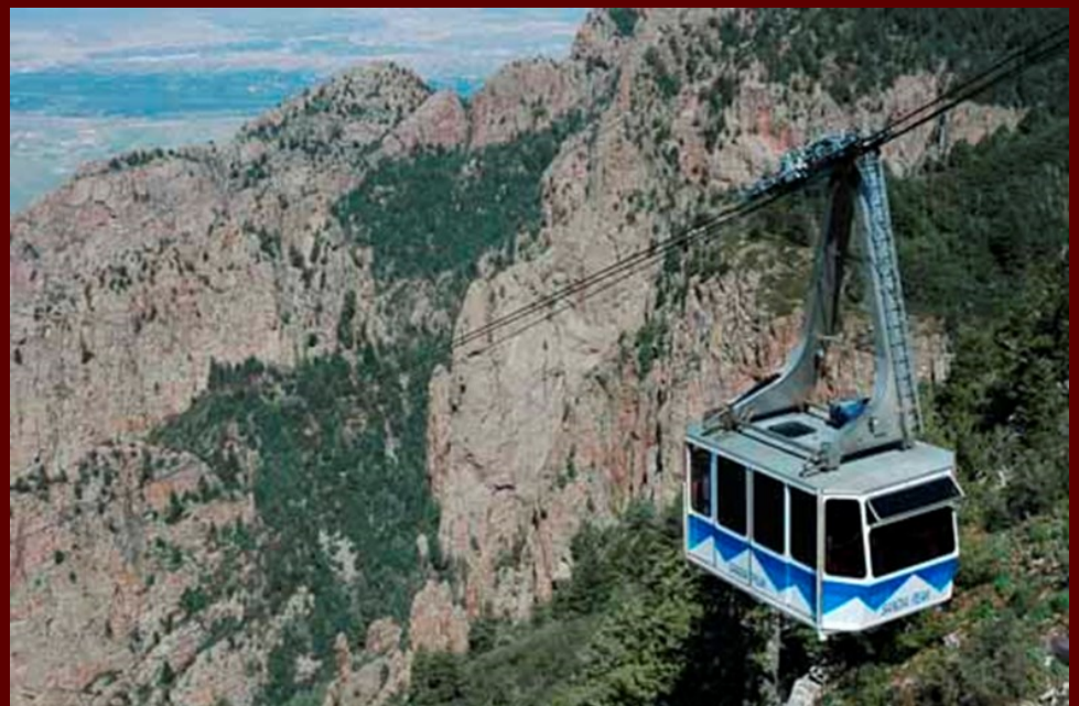
Sandia Peak Tramway

Check www.NMSAP.org after November 1 for more details