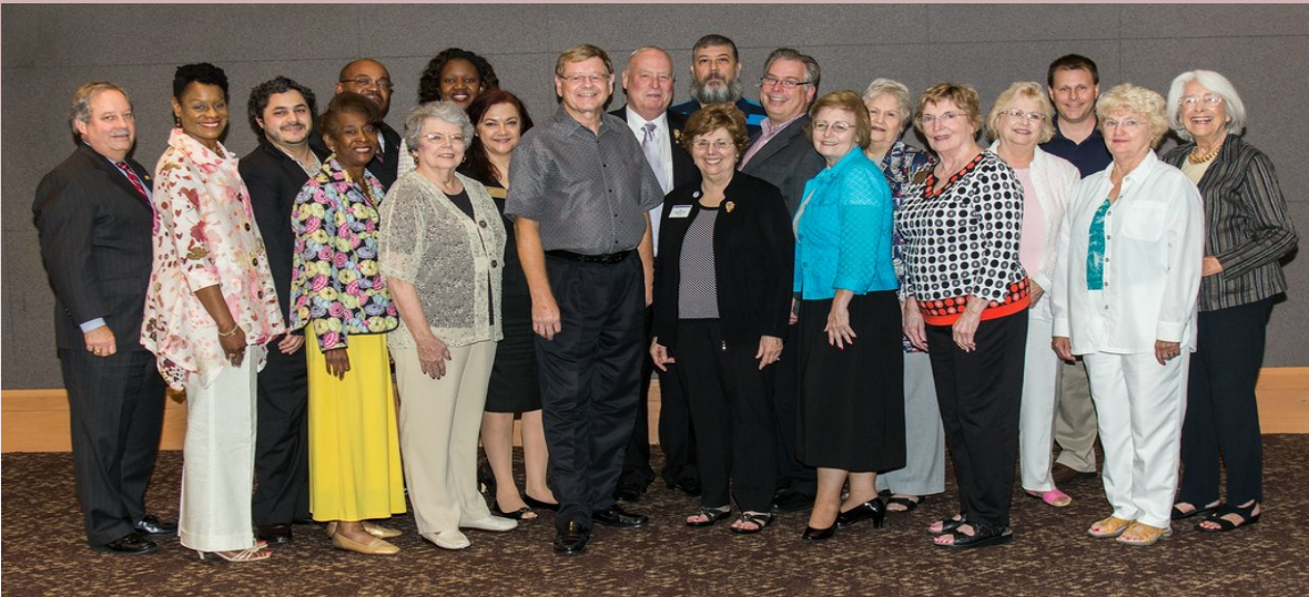
Texas Delegation at the 2014 National Training Conference, Oklahoma City, Oklahoma,

That is the big parliamentary news in Texas right now – but we do hope that those of you who enjoy learning at every opportunity – please put the dates of May 1-3, 2015 on your calendar. This is the date for the Texas State Convention. We have some wonderful ideas for great learning experiences at the meeting in Houston.