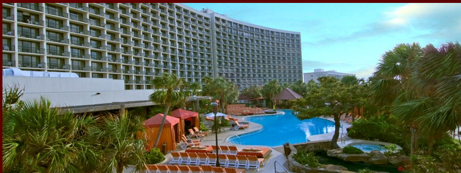
The San Luis Resort and Spa and Conference Center Galveston, Texas