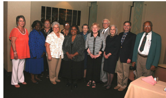
Calumet Unit Members celebrate 25th Anniversary