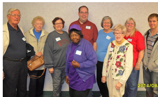
WI members of combined unit

In October, The Milwaukee Area Evening Unit dissolved and voted to merge their membership with the Milwaukee County Unit. While it is regretted that a unit dissolved, the good news is that members have another unit to affiliate with for continuation of their parliamentary education.