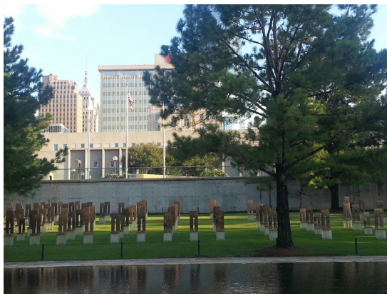
We come here to remember those who were killed, Those who survived and those changed forever. May all who leave here know the impact of violence.

A reminder that the District 4 Conference will be held in conjunction with the Michigan State Association of Parliamentarians Annual Meeting, April 10-12, 2015, in New Buffalo, MI. We look forward to your attendance, participation, and networking. So... don't forget to mark your calendar. See you at the Grand Marina Resort!