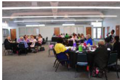
Illinois Association Annual Session 2014

All agreed that the entire day was a success.