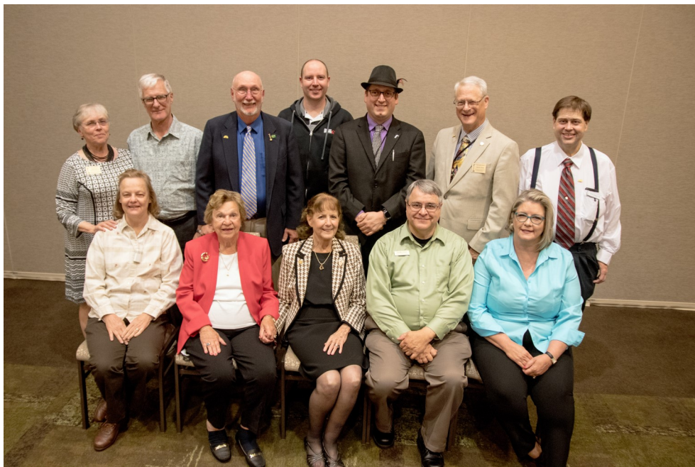
Washington State Membership at the 2017 NAP Convention