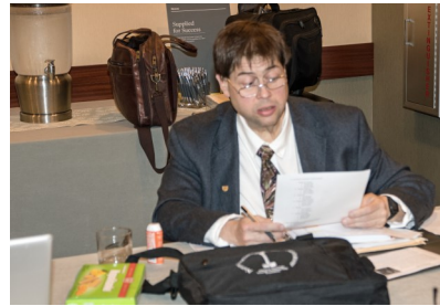
Your District Director, at one of several meetings of the NAP Board of Directors