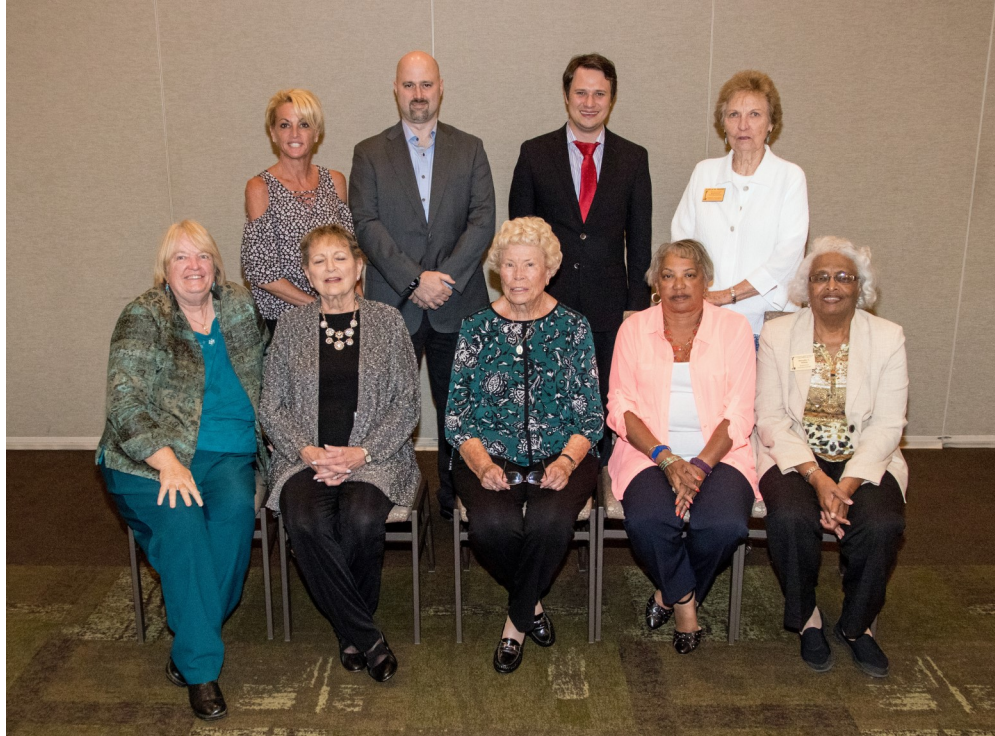
Colorado State Membership at the 2017 NAP Convention