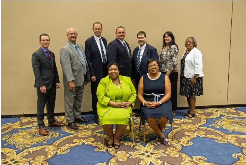
NEW 2019-2021 NAP Board of Directors