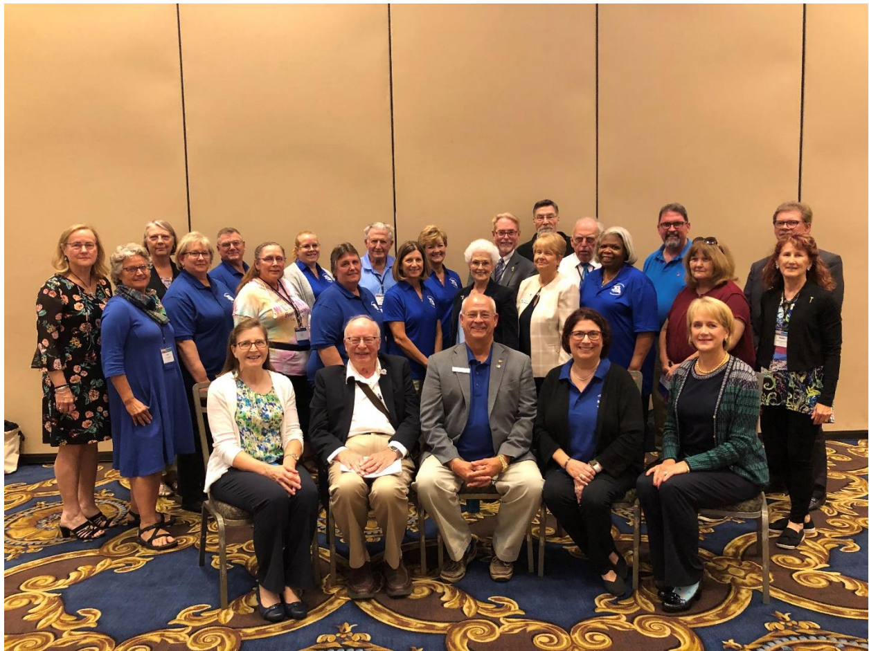
A few of the District Five attendees at the 42 nd NAP Biennial Convention, Las Vegas, NV.