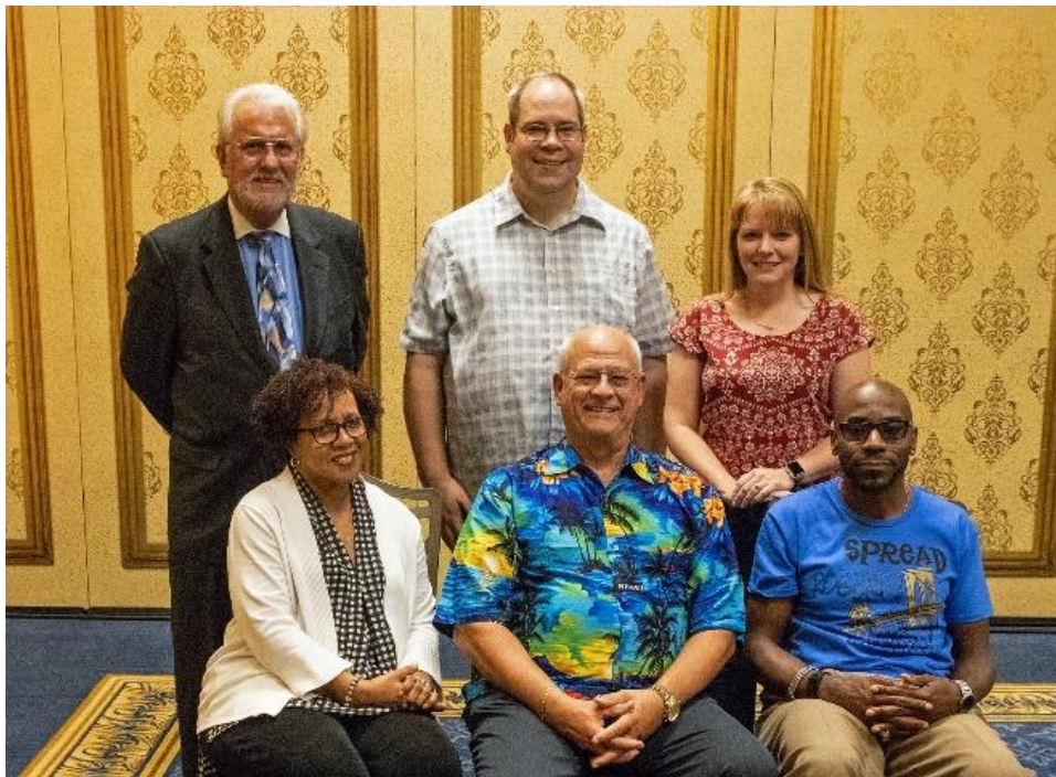
2019-2021 District Directors (6 of 8)