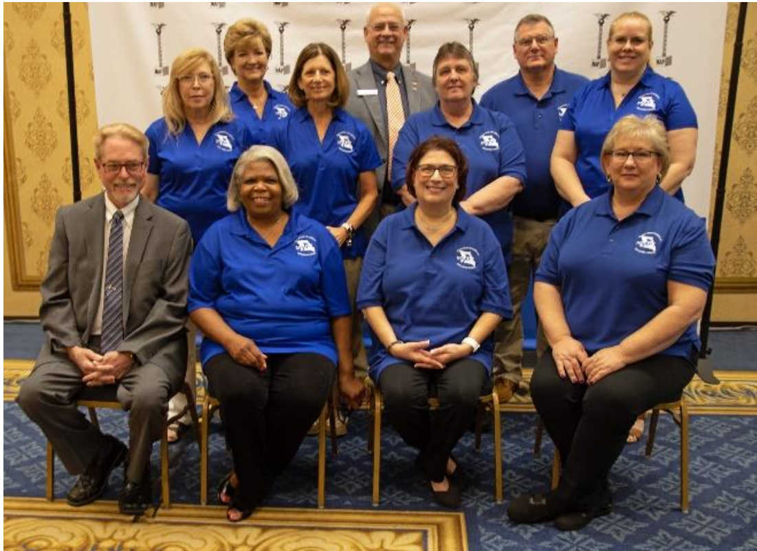
Missouri members with new MSAP Shirts