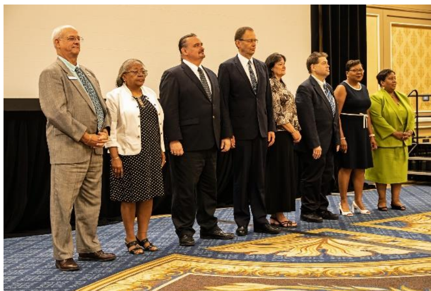
New 2019-2021 NAP Board being sworn in