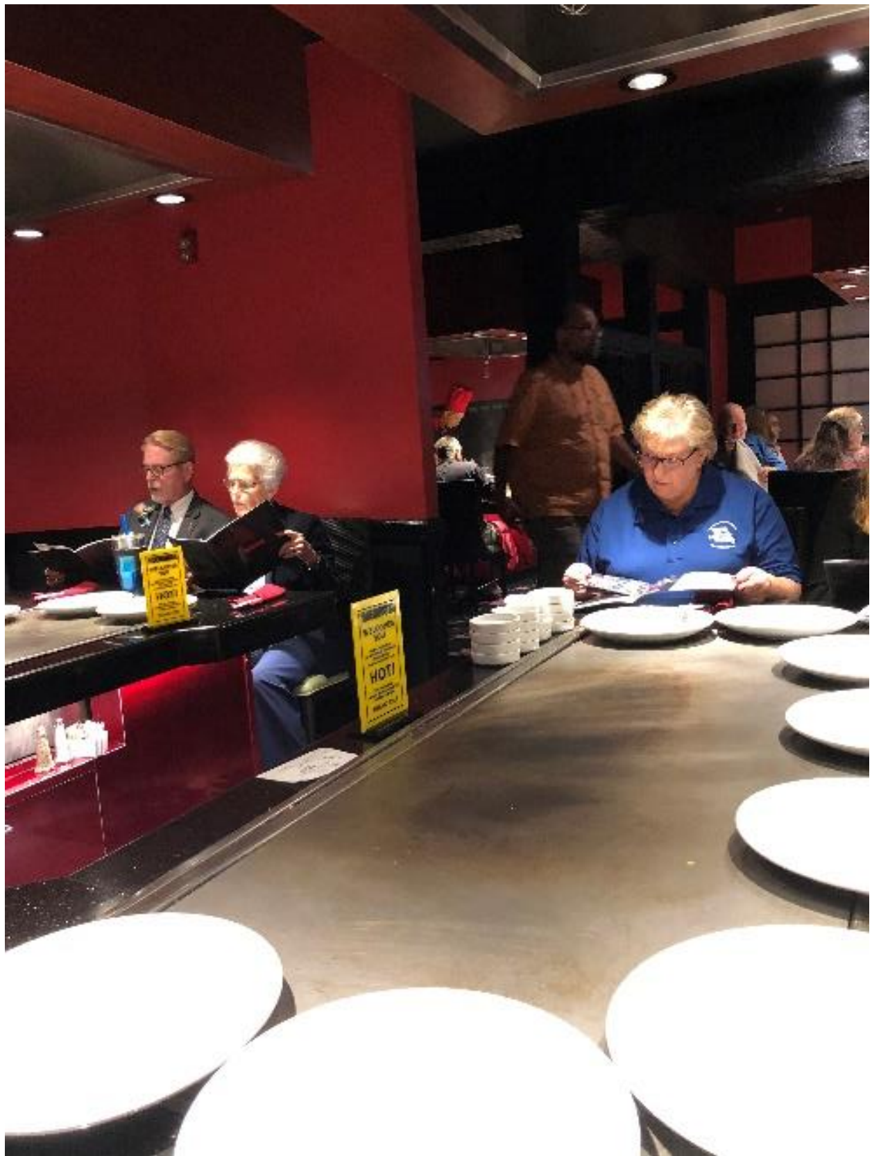
Missouri members at dinner