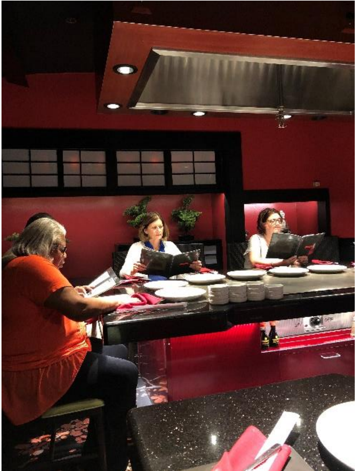
Missouri members at dinner