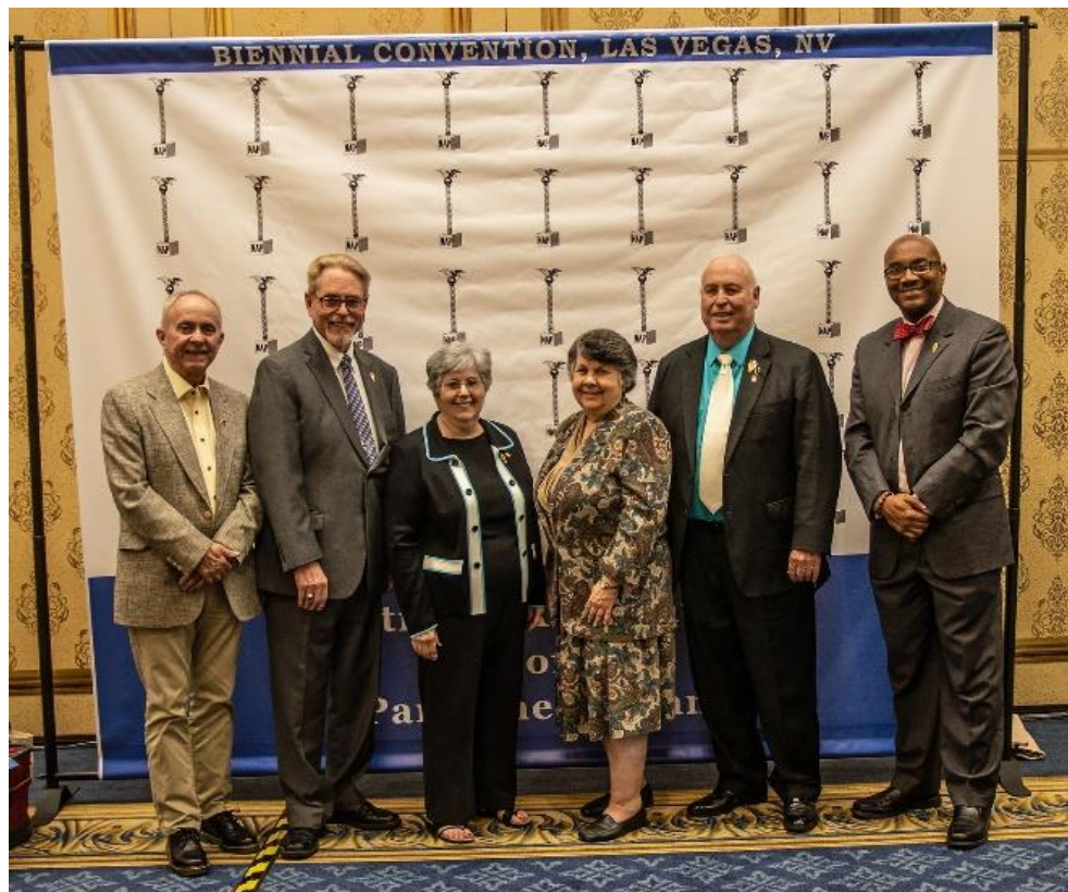
NAP Past Presidents